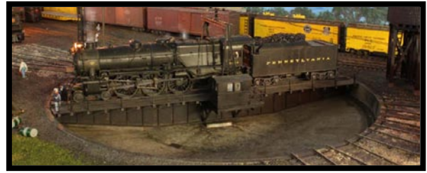
Tim Garner's HO-scale turntable.