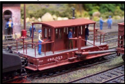
Dave Vinci's HO-scale scratchbuilt poling car.