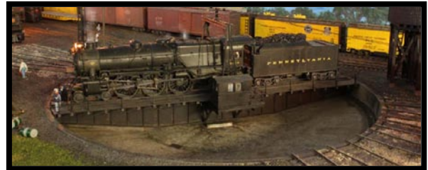
Tim Garner's HO-scale turntable.