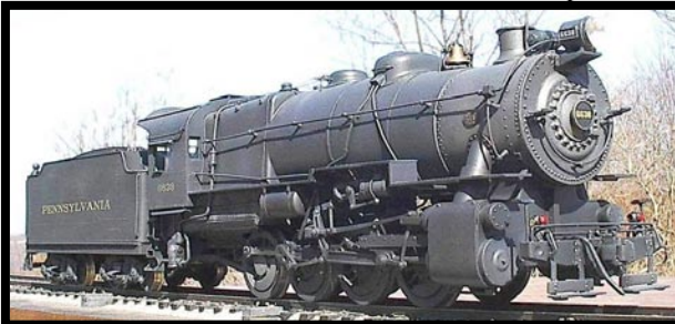
Gary Mittner's O-scale class C-1.