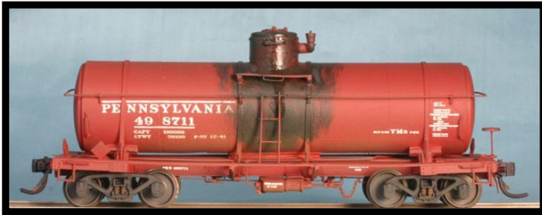
Bruce Smith's HO-scale class TM8 tank.