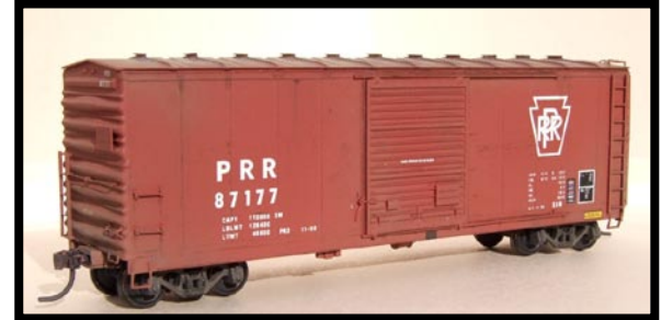
Tom Haag's HO-scale class X46 boxcar.