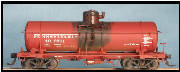
Bruce Smith's HO-scale class TM8 tank.