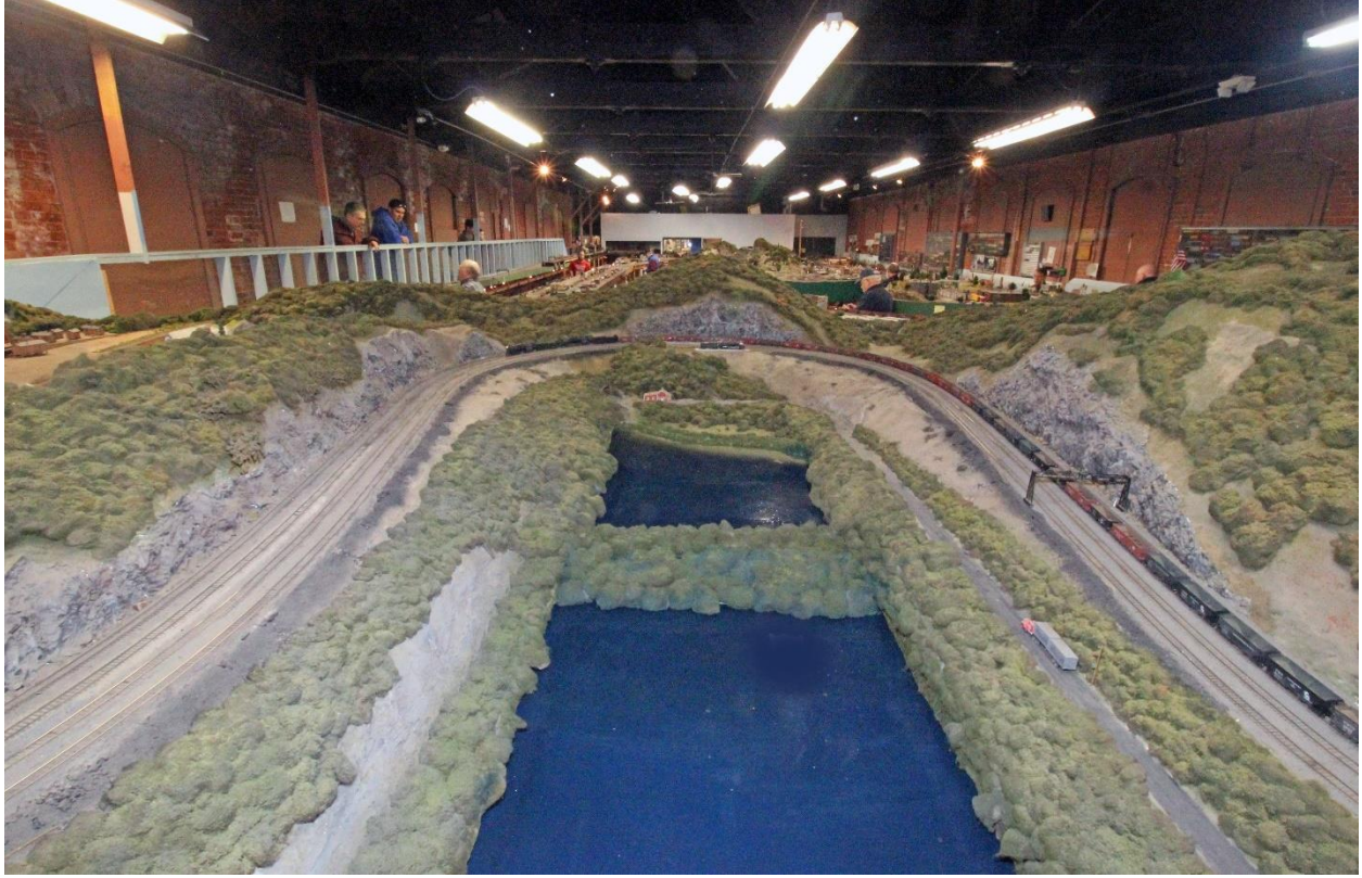
Tim Garner's train of empty hoppers is well into the Curve. Note the Altoona reservoirs, 1361 on display, and the Visitor Center. The magnitude of the layout can be assessed by noting the people on the walkway to the left above the layout.