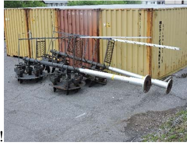
Signals are Home!!!

Lewistown maintenance man Gary Hoy was instrumental in transferring the PRR position light signals from the Norfolk Southern right of way, after weeks of laying along the right of way. The signals were placed safely behind the storage containers at the station until they can be mounted on the station grounds with the other PRR artifacts.