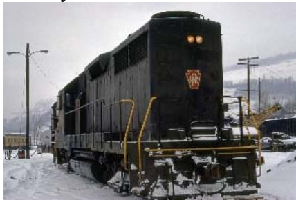
<< South Fork, PA