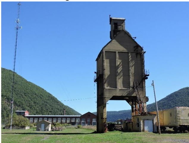
This photo was taken at Renovo, in October 2016.