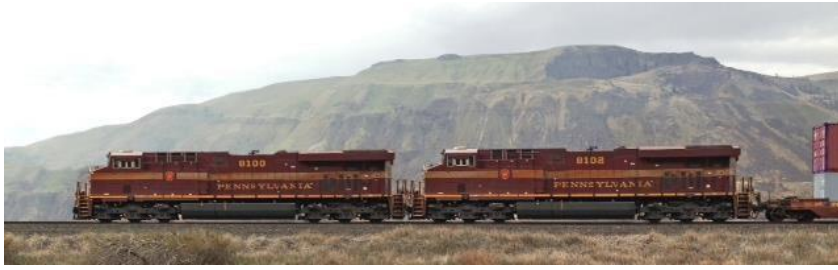
Coast to Coast Service in 2016; The Pennsylvania Railroad celebrates 170 years of operation. Photo taken at Rock Island, WA by Jim Trunzo