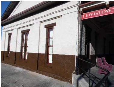
Painting completed on the west side of the station

The painting was performed by the Reedsville United Methodist Church and United Way volunteers.