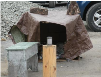
Hobo Party 2015

A picnic in July - A "Hobo Party" around the end of October, complete with hobo costumes and a bonfire - A Christmas Party in December with great food all prepared by our members, presents for the kids, and an auction with proceeds going to the local food bank