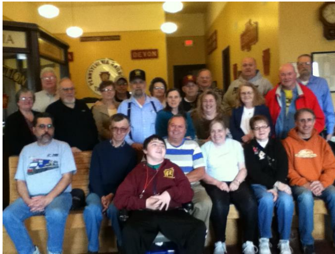
Members at the March meeting

Check out our table at the 2016 PRR Convention. I am sure you will find a “special” souvenir to take home with you.