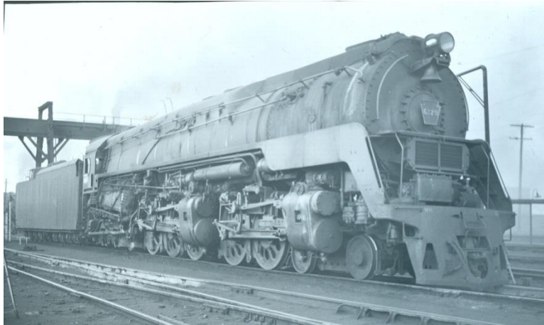
PRR Q2 #6179. Crestline assigned locomotive. @ Crestline or Chicago.

We are into a new year now, which means it is time to renew your membership and pay dues for the year. We will be accepting dues payments from library opening at 1pm until the start of the business meeting at 1:30. Please fill out a new Membership Dues Record form when paying your dues. The form is important to the Secretary in maintaining an up to date roster.