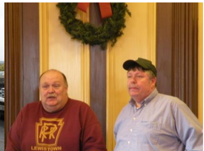
Christmas Party-Auction 2015

Our Chapter participates in "Kid Connection", an annual community event. Kids enjoy a fun day of free activities, games, and handouts. We set up a stand with a train-themed game or coloring pages, and give away a little train-themed toy.